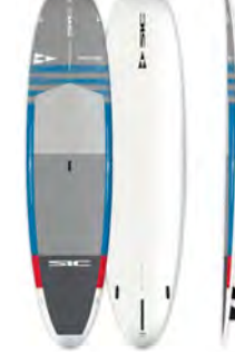
TAO SURF (AT) 11'6" x 32.5" ¥150,000(税別) 102271

Length 10'6" | 320cm Width 31.5" | 80cm Volume 185L Weight 26lbs | 11.8kg Max Rider Weight 200lbs | 90kg FCS II Connect Dolphin 10" + 2x tellar side bites