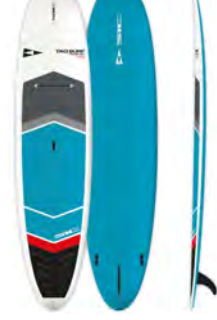
TAO FIT (TT) 11'6" x 32.5"

Length 10'6" | 320cm Width 31.5" | 80cm Volume 185L Weight 32lbs | 14.5kg Max Rider Weight 200lbs | 90kg Fin Setup Single US box + FCS I System (x2)