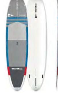
TAO FIT (AT) 11'6" x 32.5"

Length 10'6" | 320cm Width 31.5" | 80cm Volume 185L Weight 26lbs | 12kg Max Rider Weight 200lbs | 90kg Fin Setup FCS II Connect Dolphin 10" + 2x tellar side bites