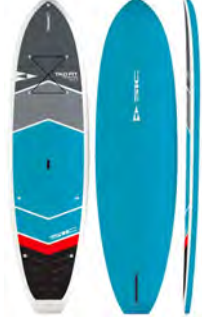
TAO FIT (TT) 11'0" x 34.0" ¥115,000(税別) 103709

Length 10'0" | 305cm Width 33.0" | 84cm Volume 195L Weight 32lbs | 14.5kg Max Rider Weight 220lbs | 100kg Fin Setup FCS II CONNECT Touring 9"