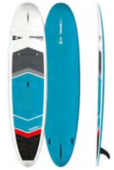
TAO FIT (TT) 11'6" x 32.5" ¥120,000(税別) 103707

Length 10'6" | 320cm Width 31.5" | 80cm Volume 185L Weight 32lbs | 14.5kg Max Rider Weight 200lbs | 90kg Single US box + FCS I System (x2)