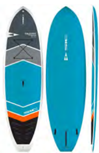
TAO FIT (TT) 10'0" x 33.0" ¥105,000(税別) 103708

Length 10'0" | 305cm Width 33.0" | 84cm Volume 195L Weight 32lbs | 14.5kg Max Rider Weight 220lbs | 100kg Fin Setup FCS II CONNECT Touring 9"