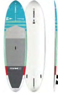
TAO SURF (AT) 10'6" x 31.5" ¥140,000(税別) 102270

Length 11'0" | 335cm Width 34.0" | 86cm Volume 260L Weight 35lbs | 16kg Max Rider Weight 285lbs | 130kg Fin Setup FCS II Connect Touring 9"