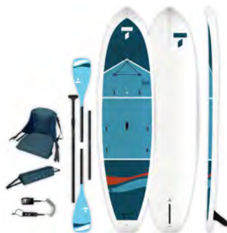
11'0" BEACH CROSS-YAK ¥120,000(税別) 108810