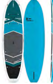
TAO FIT (AT) 11'0" x 34.0"

Length 10'0" | 305cm Width 33.0" | 84cm Volume 195L Weight 28lbs | 12.7kg Max Rider Weight 220lbs | 100kg Fin Setup FCS II Connect Touring 9"