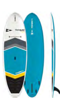
TAO FIT (TT) 9'2" x 31.5" ¥100,000(税別) 103705

Length 11'0" | 335cm Width 34.0" | 86cm Volume 260L Weight 39lbs | 17.5kg Max Rider Weight 285lbs | 130kg Fin Setup FCS II CONNECT Touring 9"