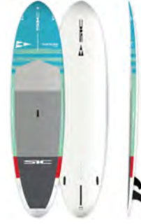
TAO FIT (AT) 10'6" x 31.5"