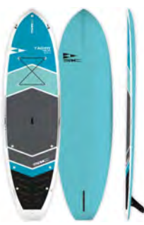
TAO FIT (AT) 10'0" x 33.0" ¥145,000(税別) 103731

Length 10'0" | 305cm Width 33.0" | 84cm Volume 195L Weight 28lbs | 12.7kg Max Rider Weight 220lbs | 100kg Fin Setup FCS II Connect Touring 9"