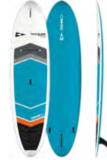
TAO FIT (TT) 10'6" x 31.5" ¥105,000(税別) 103706

Length 9'2" | 280cm Width 31.5" | 80cm Volume 145L Weight 30lbs | 13.8kg Max Rider Weight 180lbs | 80kg Single US box + FCS I System (x4)