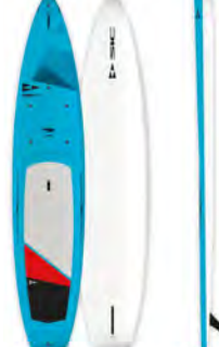
12'6" x 30.0" ¥160,000(税別) 108916

Length 11'0" | 335.3cm Width 29.0" | 73.7cm Volume 220L Weight 27.5lbs | 12.5kg Max Rider Weight 165lbs | 75kg Fin Setup FCS II Connect Touring 9"