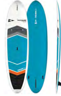
TAO FIT (TT) 10'6" x 31.5"

Length 9'2" | 280cm Width 31.5" | 80cm Volume 145L Weight 30lbs | 13.8kg Max Rider Weight 180lbs | 80kg Fin Setup Single US box + FCS I System (x4)