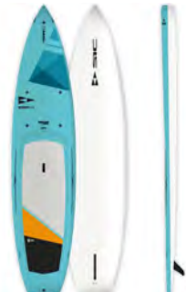
11'0" x 29.0" ¥150,000(税別) 108915

Length 11'0" | 335.3cm Width 29.0" | 73.7cm Volume 220L Weight 27.5lbs | 12.5kg Max Rider Weight 165lbs | 75kg Fin Setup FCS II Connect Touring 9"