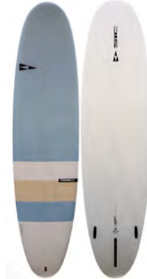
9'6" BIG BOY

Length 9'4" | 284.5cm Width 22.8" | 57.8cm Volume 78L Thickness 3.0" | 7.6cm Weight 16.5 lbs | 7.5kg Max Rider Weight 230 lbs | 105kg Fin Setup FCS 8" + 2 x FCS GL Side Fins